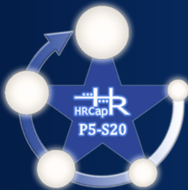
HRCAP P5-S20 RECRUITING MODEL